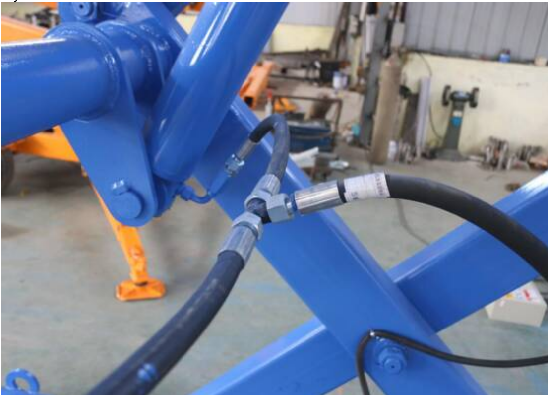
Hydraulic tube oil