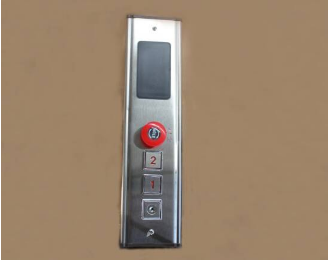
Digital control panel