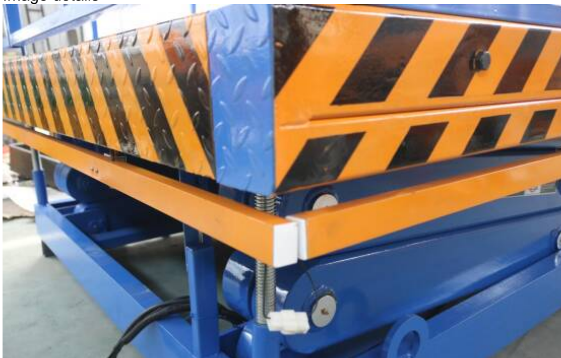
Travel safety bar